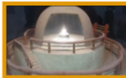
Ergonomic Design Preserving Original Fossil of Lord Buddha