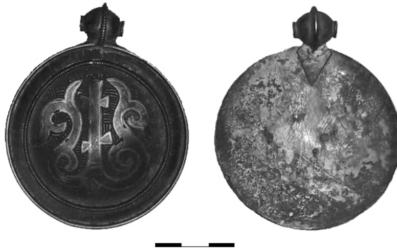
Fig. 1. The real view of medallion.

Analogues of such medallion are in the expositions of the Moscow Kremlin Museum which consist mostly of silver or gold. One of the aims of this research is a determination of the main type of metal (silver or copper) on the surface and into the bulk of medallion, and reconstruction the possibility type of manufacturing procedure (silvering etc.).